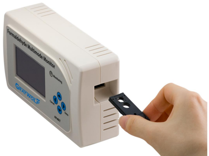
Inserting a reusable cartridge into the FM-801

The FM-801, along with all GrayWolf units for a wide variety of parameters, are available for rental as well as purchase. The FM-801 is able to work as a stand-alone monitor, with logged data downloaded to GrayWolf's WolfSense PC data transfer and reporting software. The FM-801 may also be interfaced to other GrayWolf equipment for simultaneous display, logging and remote on-line access of multiple parameters.